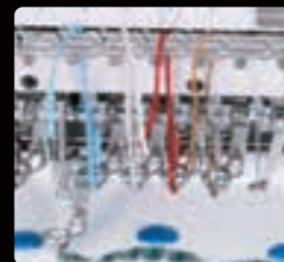
Multi cording Device

Embroidering 6 various types/colors of cords