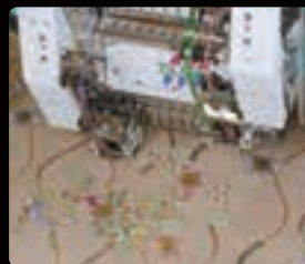
Sequin Device III [Twin Type]<PAT>

Embroidering 2 different sequins by freely switching them at high speed