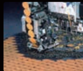
Sequin Device IV

Embroidering 2 different sequins by freely switching them at high speed